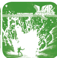
The Flaming Lips