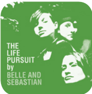
Belle & Sebastian