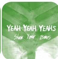
Yeah Yeah Yeahs